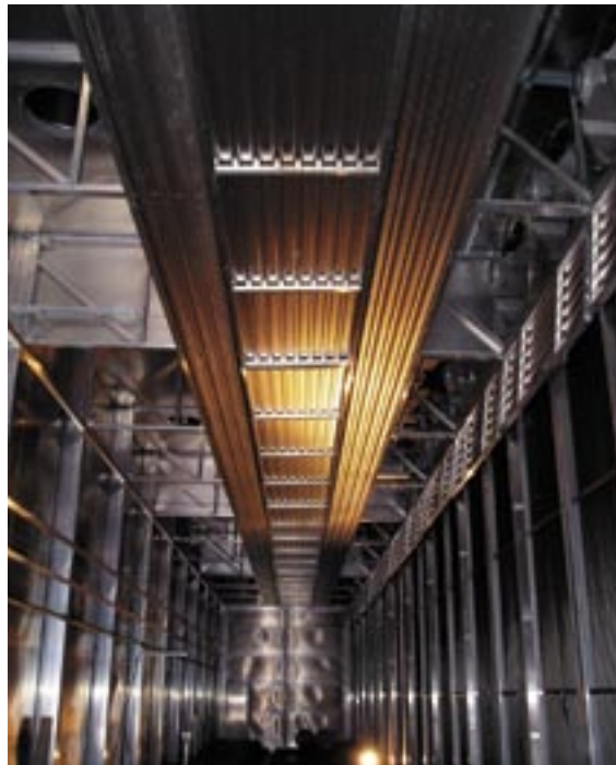
Distribution of final moisture content